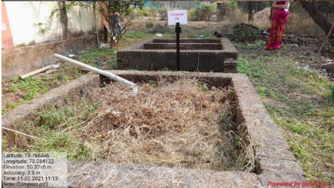
Solid waste manegement